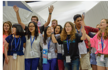
Youth Program.

Each morning will feature speakers chosen by the Young Anabaptist Committee and by one of the MWC Commissions. Youth will be actively involved in the program on stage. Singing together will be a major part of our celebration.