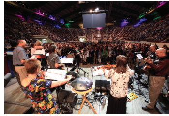
Evening Worship.

Each evening will have special music and speaker from one continent.