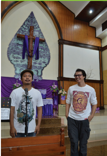
Assembly Scattered.

6-11 July 2021 Assembly Gathered Holy Stadium, Semarang, Central Java, Indonesia Theme: Following Jesus together across barriers.