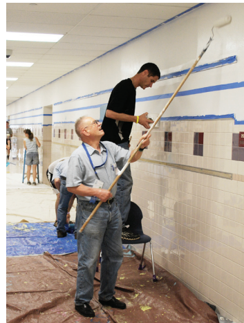
Service Opportunities.

Afternoon activities will include workshops, service opportunities, local tours, sports, Global Church Village and Anabaptist World Cup.