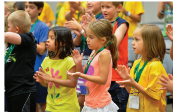
Children's Program.

Children will join the morning singing with their families. From there they will be welcomed into their own program in different age groups. The program will involve story telling around the biblical message. There will be games, crafts, singing and tons of fun. The program will include lunch and end before supper.