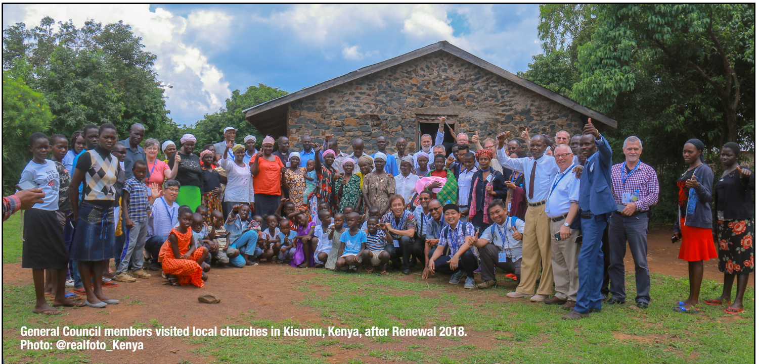
General Council members visited local churches in Kisumu, Kenya, after Renewal 2018.

The biblical texts, prayers, song suggestions, sermon ideas and other resources in this package have been prepared by members of MWC out of their experience in their local context. The teaching does not necessary represent an official MWC position.