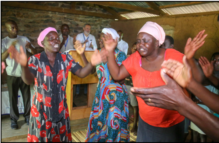
Women dance in worship in Kisumu, Kenya, in 2018.