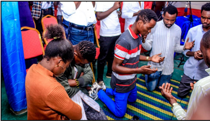
A service of thanksgiving for graduates at Paroisse Missionnaire Shalom de Bukavu in DR Congo.

without having seen him. This man said to himself that the day when Jesus would pass by him, he would not miss the opportunity to challenge him. His hope was in Jesus.