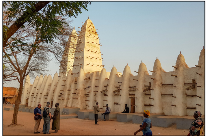
A mosque in Burkina Faso.

Jesus is our hope: even if we go through the valley of the shadow of death, he is by our side.