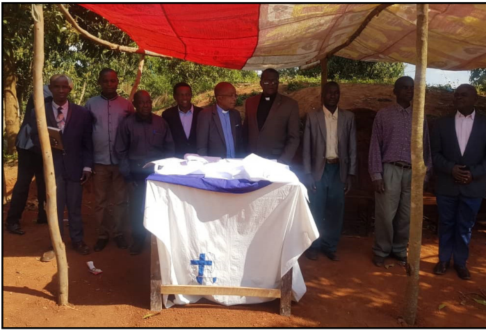
Brethren in Christ Church Mozambique annual general conference July 2022 in Milange, Mozambique.

God is our home, our refuge and our hope in times of trial.