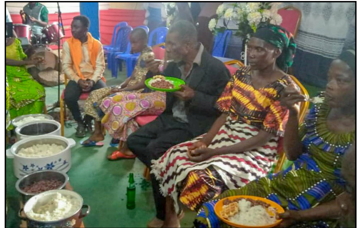
Anabaptist World Fellowship Sunday celebration at Paroisse Missionnaire Shalom de Bukavu in DR Congo.

together before or after worship on Anabaptist World Fellowship Sunday.