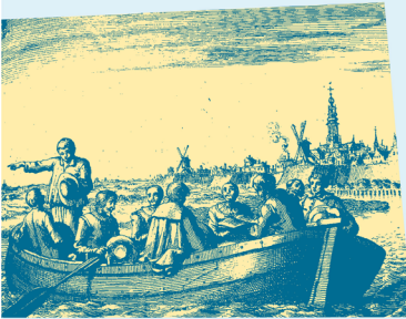
Pieter Pieters Beckjen (from Martyrs Mirror, page 739)