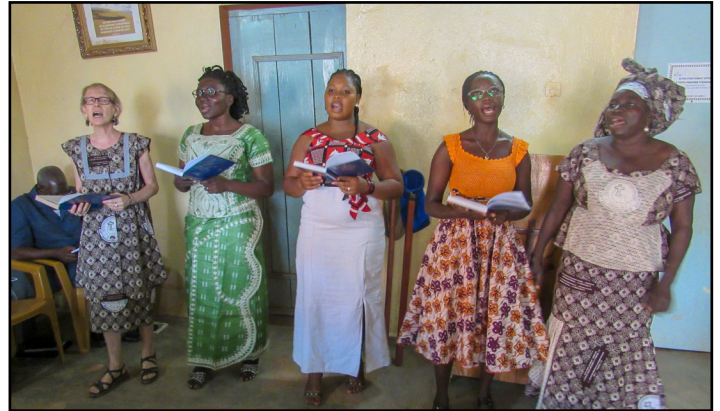
Church members sing in Ouagadougou, Burkina Faso, during the Deacons delegation visit in 2020.