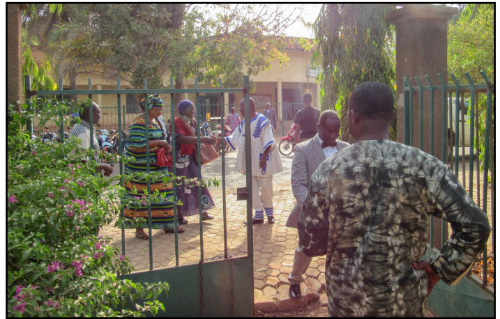
Church members greet each other after a service in Burkina Faso in 2020.