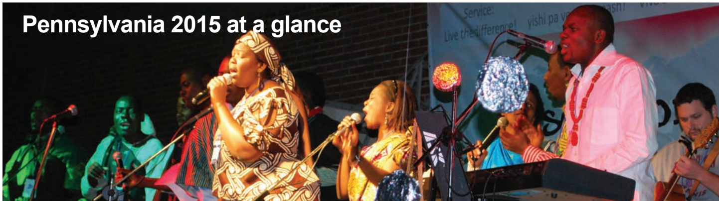
Africa night, Asunción, Paraguay 2009.