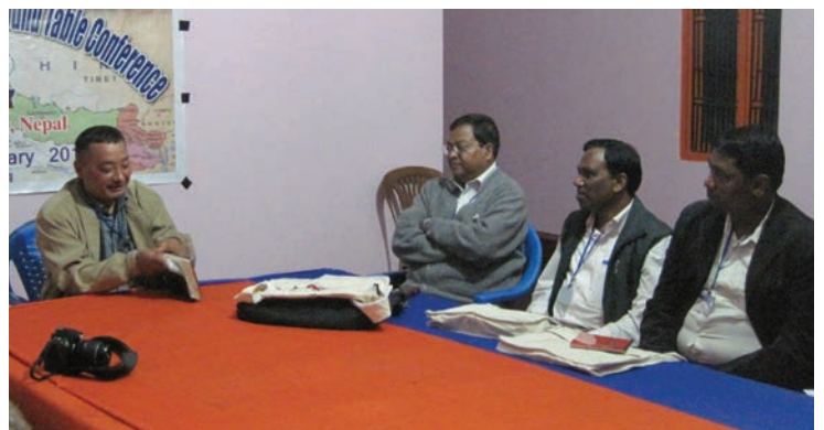
Indian and Nepalese Brethren in Christ leaders come together for a summit, sponsored by IBICA, in February 2011.