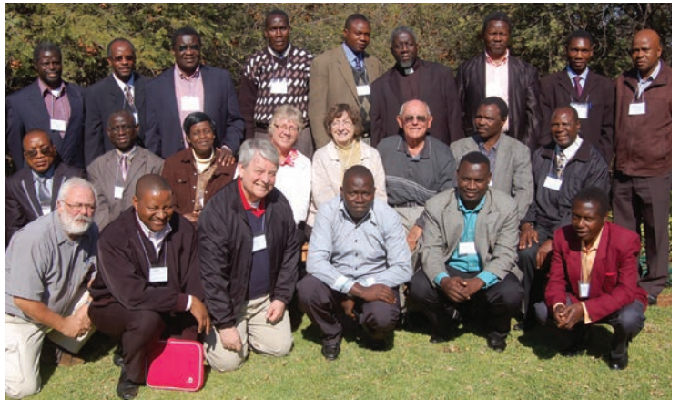
African Brethren in Christ church leaders and IBICA administrators pose for a photo during the summit held in Pretoria, South Africa, in June 2013.