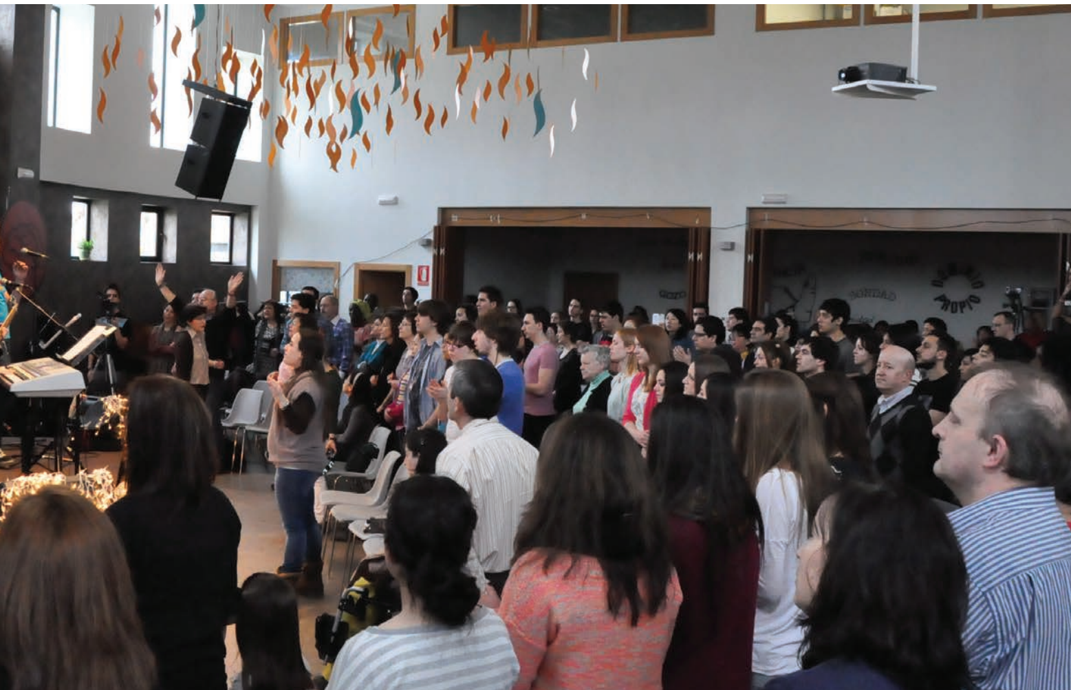
A worship service at the Burgos Anabaptist Church in Spain.

European Mennonite Conference (MERK) was held in Barcelona, bringing together Mennonites from across the European continent for encouragement and discussion.