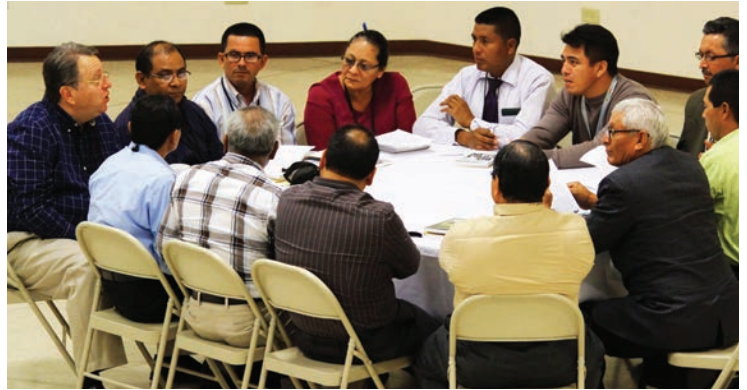
Brethren in Christ leaders from throughout Latin America discuss a variety of issues during a breakout session at the IBICA summit, held in San José, Costa Rica, in December 2013.