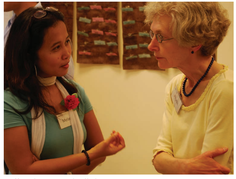
Two Mennonite women, one from North America and one from Indonesia, converse. For Anabaptists, MWC is the place where such intercultural contact is possible.

MWC is a place for us to learn from our cultural diversity about what it means