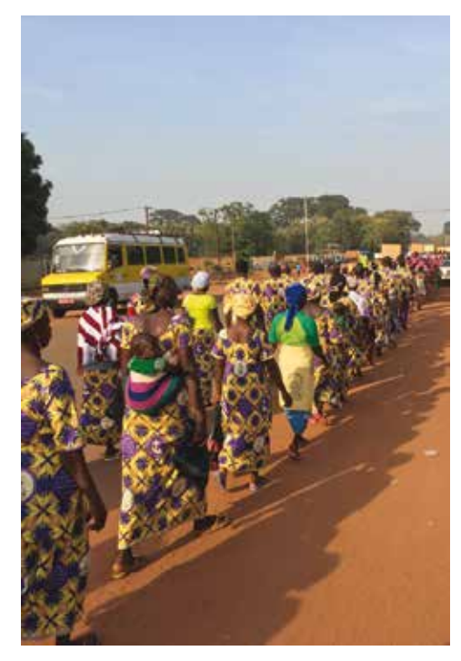
To celebrate their 40th anniversary, members of EEMBF (the Mennonite church of Burkina Faso) paraded through the village of Orodara.

Although we are small in number, EEMBF is not seen as lesser among its sisters. We give thanks to God for this attitude of humility.