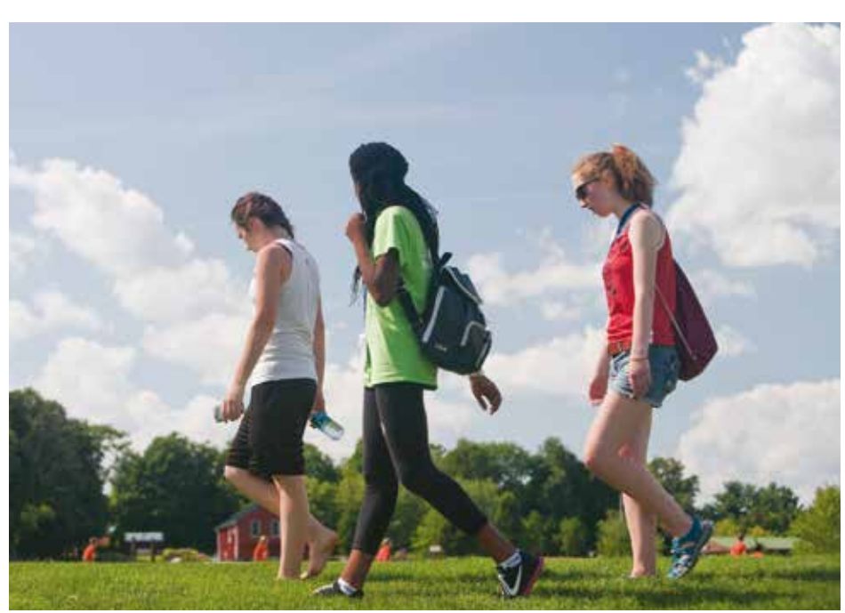
Peacemaking youth from many countries play football (soccer) together in the Anabaptist World Cup at Assembly 16 in Pennsylvania, USA.