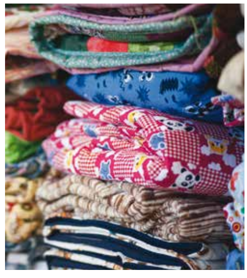
Hand-stitched quilts for relief.

As such, many of our churches in different cultures face the same dilemma: Should we back anti-immigration laws in our country? or should we help those that