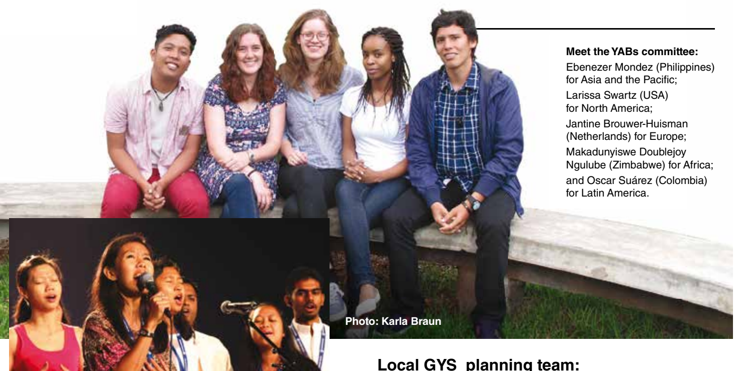
Worship at GYS 2015.

At the last GYS, a delegate from each continent was chosen to represent the young Anabaptists from their continent.