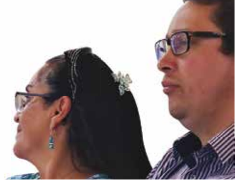
Costa Rican Mennonite leaders share joys and challenges with the MWC Executive Committee.