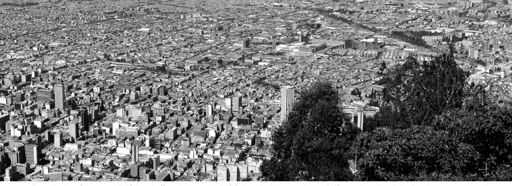
Bogotá, site of the new MWC head office, is the capital of Colombia, home to three MWC member church bodies (see pages 6 to 7).

see ourselves as a family sharing our joys and sorrows."