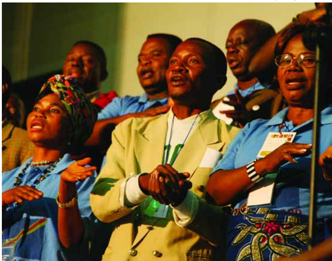
A choir from the Democratic Republic of Congo sings during the Thursday evening worship services. Choirs were a part of each

Rather, he noted the Hebrew definition of “glory” as described in John 17 denotes receiving a significant gift from God. It is something the believer is