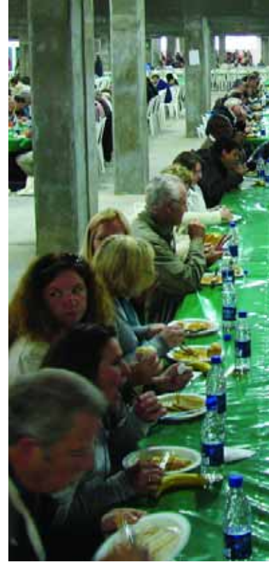
Far right: dining was on the first level of a two-level parking garage under the CFA.