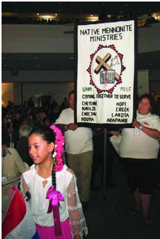
With a Paraguayan harp orchestra providing music (opposite page, top), a procession of banners from congregations, conferences,