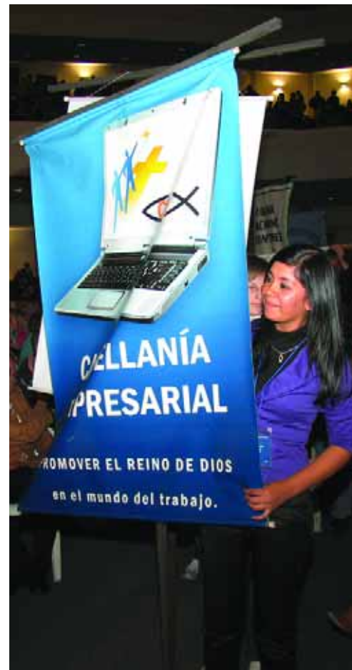
and other groups around the world (above) opened MWC's Assembly 15 on July 14. After the procession, the banners were hung on

Church, Baptist World Alliance, Catholic Church, Lutheran World Federation, Methodist Church, African Instituted Churches, Salvation Army, General