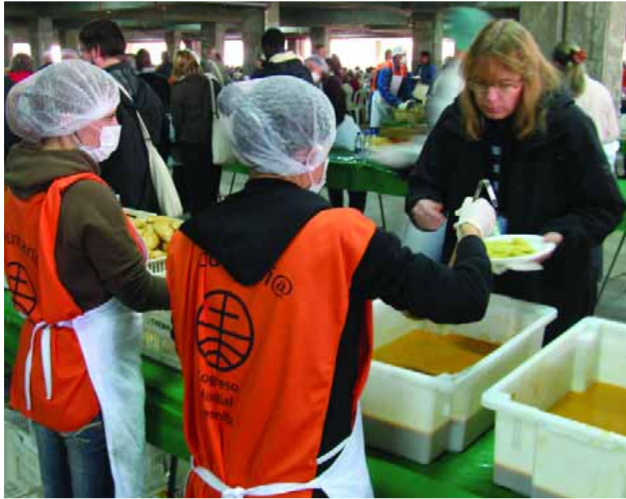
Right: 60-plus volunteers worked at 12 serving stations to feed 6,204 people in an hour.